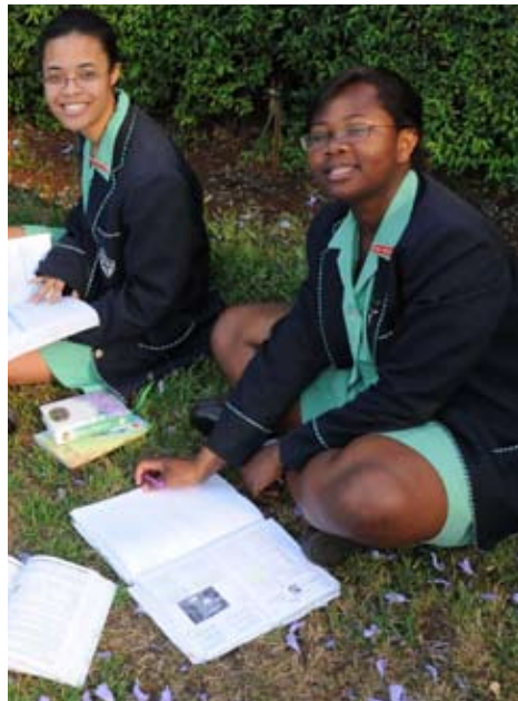
STUDY BUDDIES: Studying with a friend can help you stay motivated

You can read more about the Bill of Responsibilities for the Youth of SA on page 3.